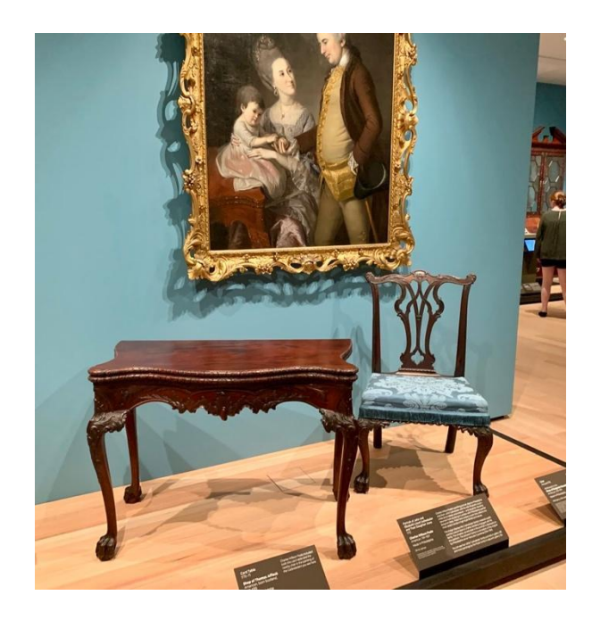
Figure 3: Charles Willson Peale portrait of the Cadwalader family and card table by shop of Thomas Affleck.

objects as culturally expressive objects that are useful for understanding the cultural context in which they were made. Furthermore, the "Objects in Motion" gallery explicitly addresses the lack of indigenous artwork, which was formerly considered in the early twentieth century as suitable only for ethnographic and archeological museums. On a wall label for this gallery, the PMA states its intention to carefully acquire indigenous objects for its collection as it works towards a more representative early American collection. Throughout the McNeil Galleries, the dismantling of artistic hierarchy is apparent, as a Pennsylvania German wrought-iron hardware, a Lenape or Shawnee bandolier bag, a Copley portrait, and a silver tea pot by Joseph Richardson Jr. in its collection are of equal value here as artifacts that "stand-in" for the marginalized people and stories that were critical in shaping early America.