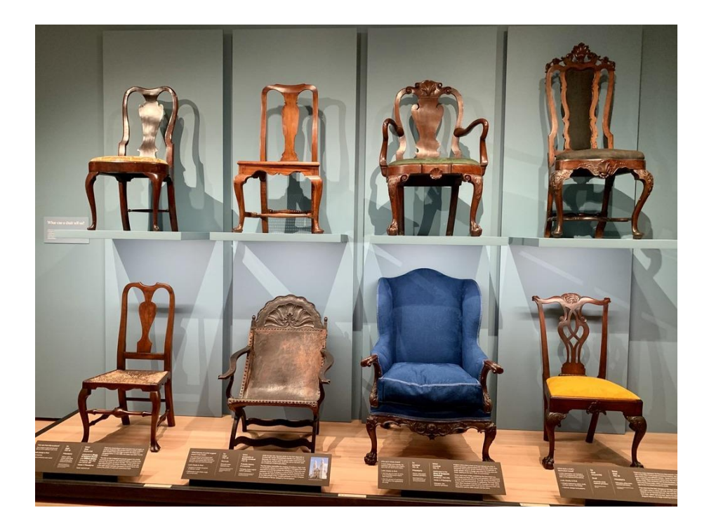
Figure 2: Chair display.

produced in different times or in different places. This variety reflects shifts in style..."viii The wall label next to the McNeil Galleries' chair display asks visitors "What can a chair tell us?" without answering its own question, in my opinion, simply concluding: "Close looking can tell us about these chairs' histories and their significance to the people who once made and used them." I agree, but it is possible to say more: it can show us the differences and similarities between cultures' views on socialization, beauty, comportment, "the good life," as just a few examples. A comparison of a chair made in Bermuda and a Campeche or Butaca Armchair from Mexico is just one case in point.